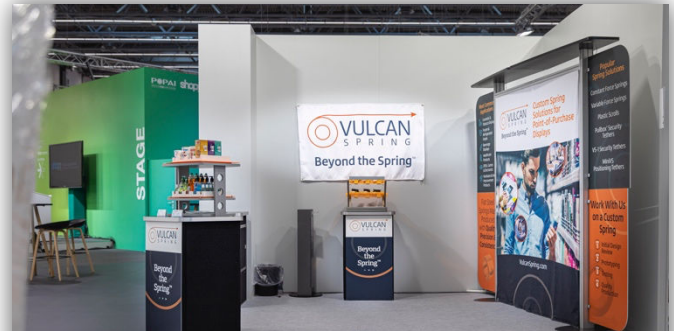
12 sqm complete package with standard booth construction and decoration by exhibitor