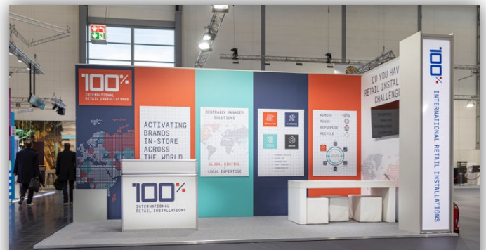
18 sqm with individual booth construction