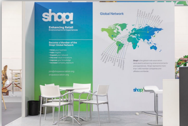
12 sqm complete package with standard booth construction and extra artwork