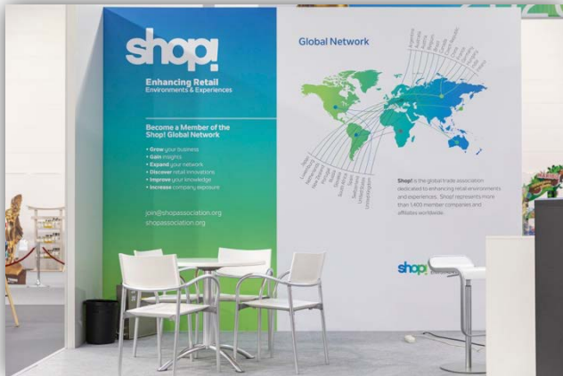
12 sqm complete package with standard booth construction and extra artwork