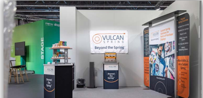
12 sqm complete package with standard booth construction and decoration by exhibitor