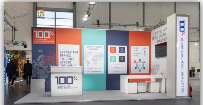
18 sqm with individual booth construction